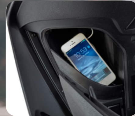
USB PORT FOR SMARTPHONE CHARGING