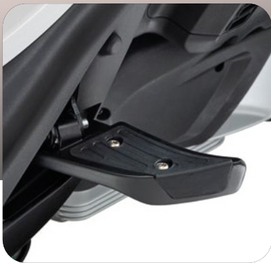
RETRACTABLE PASSENGER FOOTPEGS