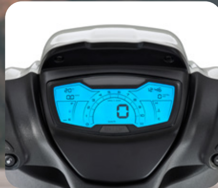
COMPLETELY DIGITAL LCD DASHBOARD