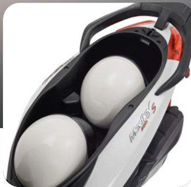
HELMET COMPARTMENT SPACIOUS ENOUGH FOR TWO JET HELMETS