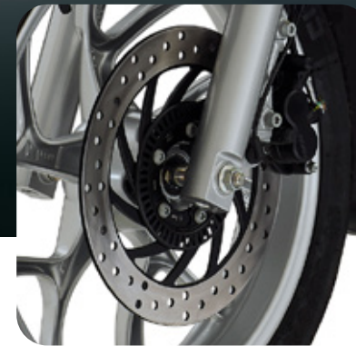
DUAL-CHANNEL ABS SYSTEM