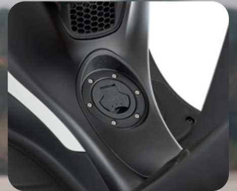
FUEL TANK CAP ON THE CENTRAL TUNNEL