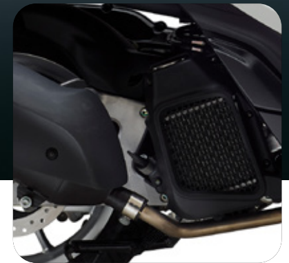
I-GET ENGINES WITH START & STOP SYSTEM